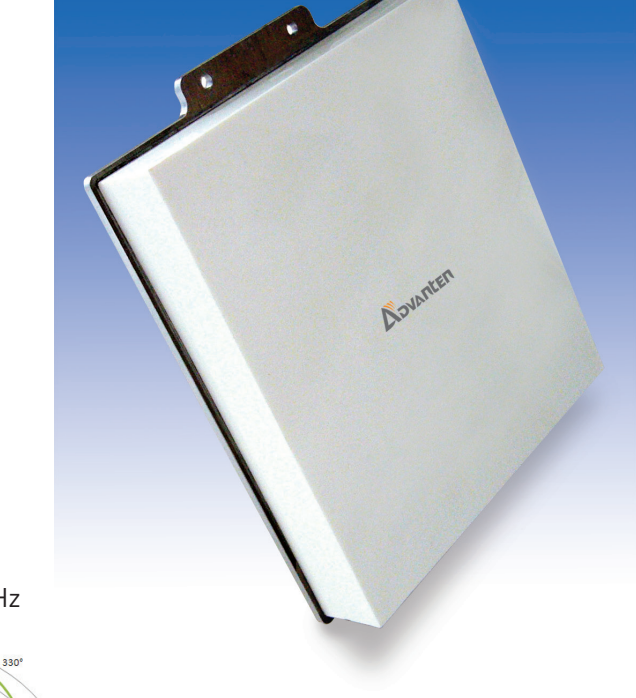
E-plan 870 MHz